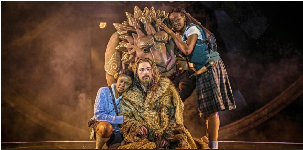
QUARRY THEATRE 850 CAPACITY