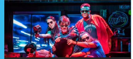
COURTYARD THEATRE 420 CAPACITY