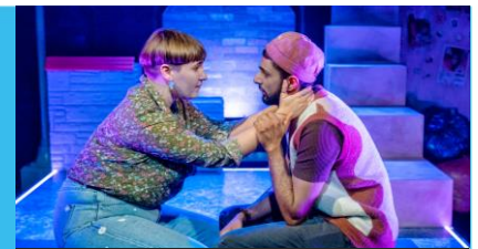
BRAMALL ROCK VOID 100 CAPACITY